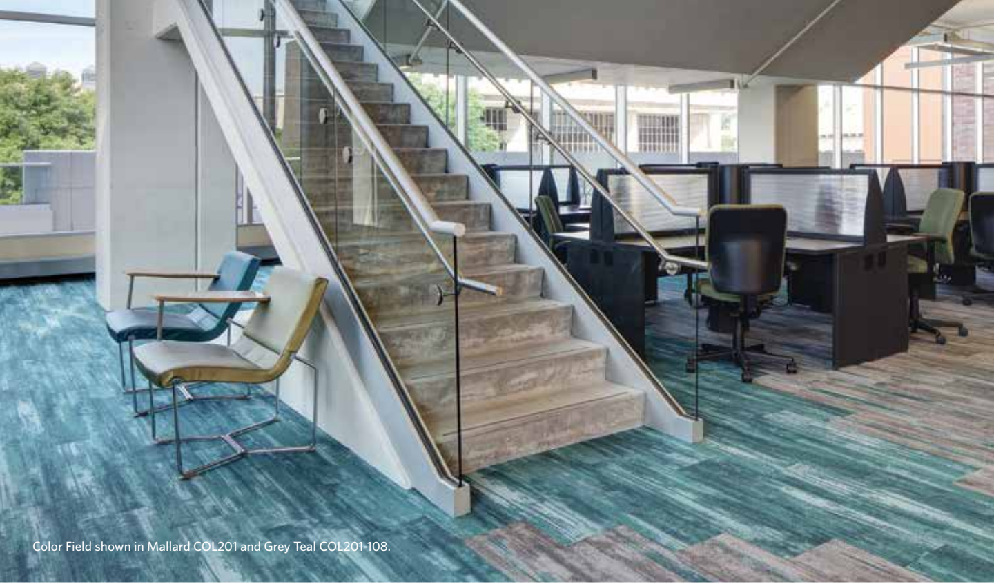
Color Field shown in Mallard COL201 and Grey Teal COL201-108.