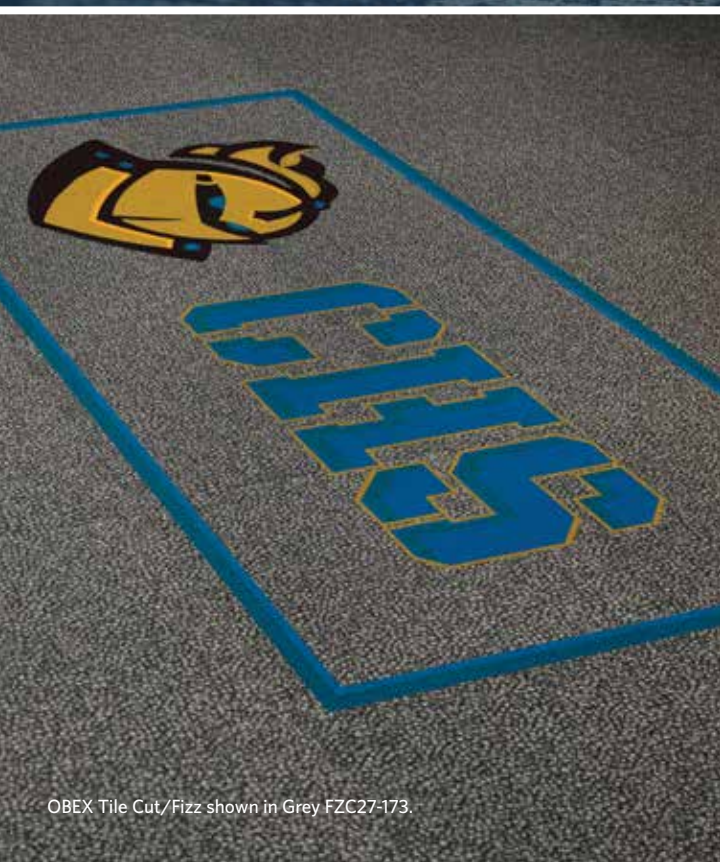
OBEX Tile Cut/Fizz shown in Grey FZC27-173.