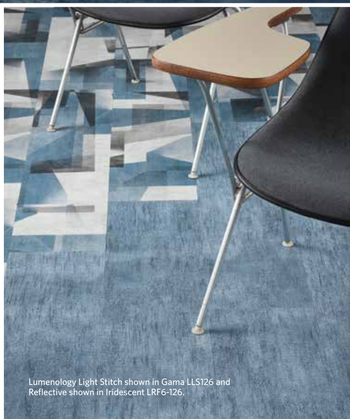
Lumenology Light Stitch shown in Gama LLS126 and Reflective shown in Iridescent LRF6-126.