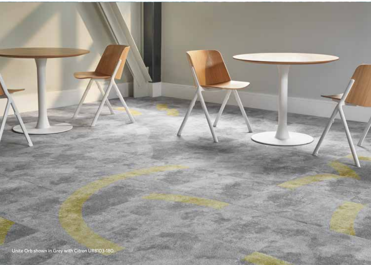
Unite Orb shown in Grey with Citron URB103-180.