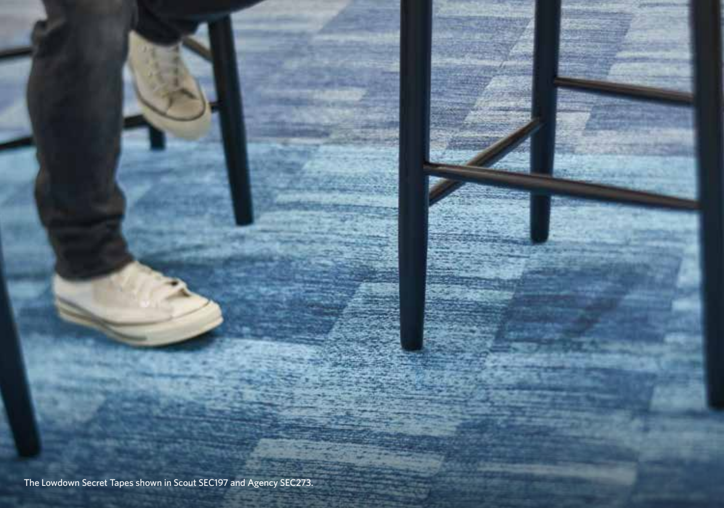
The Lowdown Secret Tapes shown in Scout SEC197 and Agency SEC273.