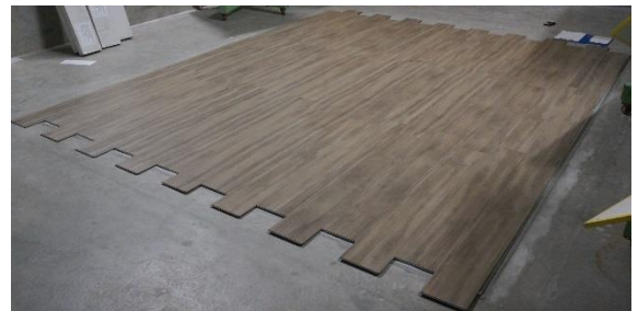
Test specimen installed in laboratory for test.