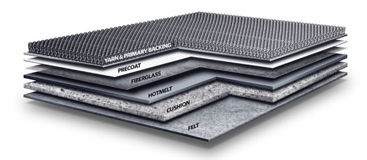
Figure 1: Illustration of Milliken Carpet Tile Construction