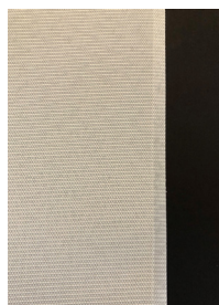
Super Plus II Sealed