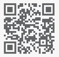
Scan to explore the collection

Inspired by the rhythmic flow of landscapes seen from an airplane window, the Echo Field collection invites you to step into a world where vast landscapes filled with the serenity of nature and organic patterns unfold beneath your feet. With its 2 patterns and 13 colors, Echo Field mirrors the patchwork of colors and textures found in cultivated landscapes.