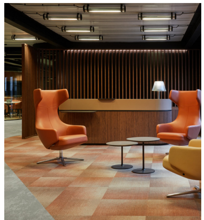
Carpet : Crafted Series – Modern Maker and Tracing Landscapes – Geography Lessons