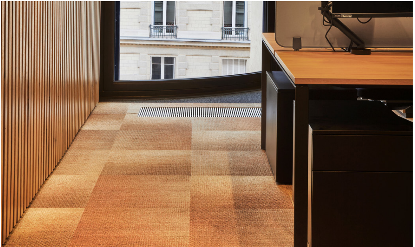
Carpet : Crafted Series – Modern Maker