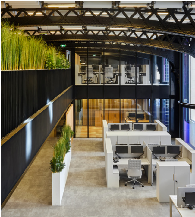
Carpet : Tracing Landscapes – Geography Lessons

wood screening. Reflecting the colours, textures, and forms found in the natural environment, Geography Lesson—specified in the pale grey shades of Wind Vane—perfectly complements the furniture in this calm work environment.