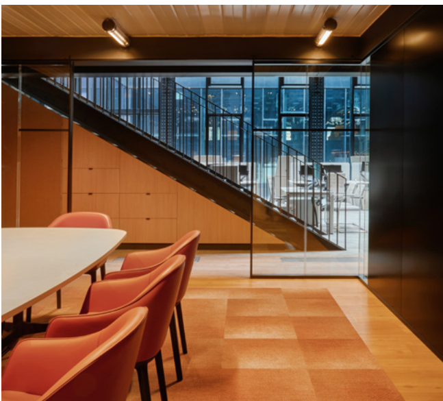
Carpet : Crafted Series – Modern Maker