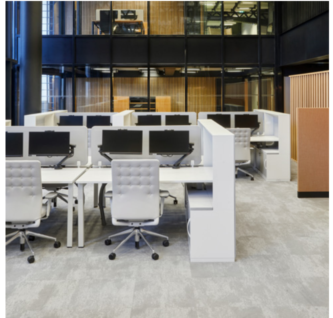
Carpet : Tracing Landscapes – Geography Lessons

The acoustic performance of the carpet's WellBAC™ cushion backing also helps people to concentrate more easily by absorbing some of the distracting noise of people moving around and interacting.