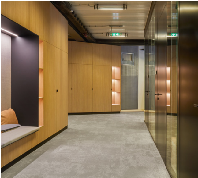
Carpet : Tracing Landscapes – Geography Lessons

“As it flows through the corridors, the carpet’s tufted, textured tip shear finish is luxurious and sophisticated.”