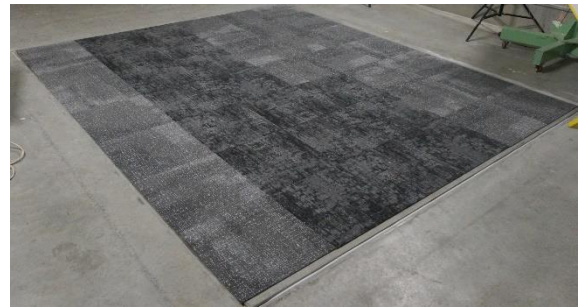
Test specimen installed in laboratory for test.