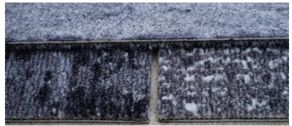
Close up of carpet tiles, showing face, edge and backing.