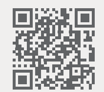
Scan to explore the collection

OBEX™ Tile Entrance Flooring's modular system installs easily and combines moisture-absorbing nylon and dirt-scraping monofilament fibers to trap dirt and prevent up to 98% of debris from entering a facility. An extensive selection of materials, patterns and colors contribute high-performing entry systems without compromising creative freedom.