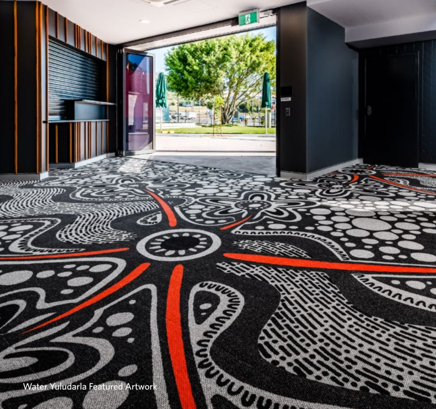
Water Yuludarla Featured Artwork