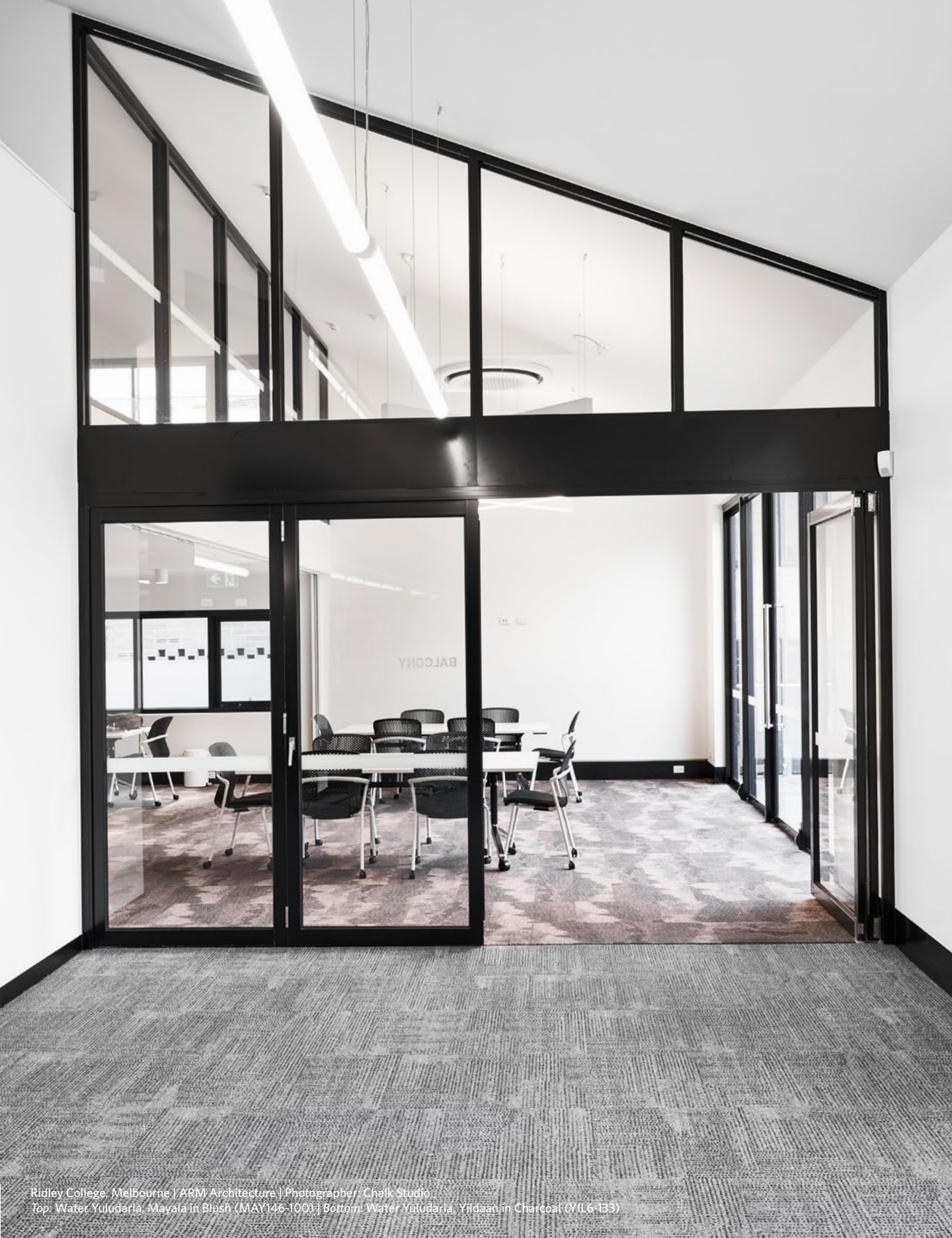
Ridley College, Melbourne | ARM Architecture Top: Water Yuludarla, Mayala in Blush (MAY146-100) | Bottom: Water Yuludarla, Yildaani in Charcoal (YIL6-133)