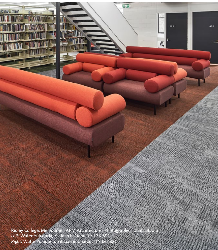
Ridley College, Melbourne | ARM Architecture Left: Water Yuludarla, Yildaah in Ochre (YIL33-59) Right: Water Yuludarla, Yildaah in Charcoal (YIL6-133)