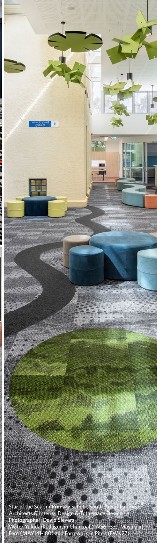
Star of the Sea Jnr Primary School, South Australia | Edge Architects & Interior Design & Totalspace Design Water Yuludarla, Jagun in Charcoal (JAG6-133), Mayala in Fern (MAY141-180) and Formwork in Pitch (FWK27)