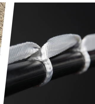
Legibility and softness