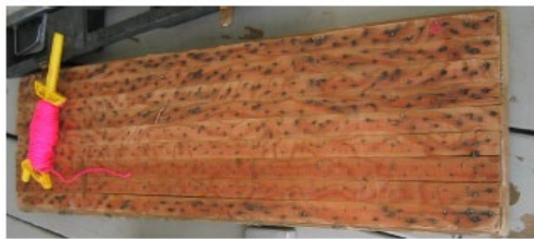
Deadman & dry line