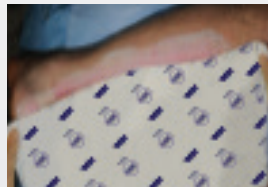
Day 1: ASSIST Silver applied directly to graft