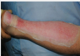
Day 1: Graft Site