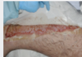
Day 2-7: ASSIST Silver is easily removed