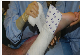
Day 1: Roll gauze applied to secure ASSIST Silver