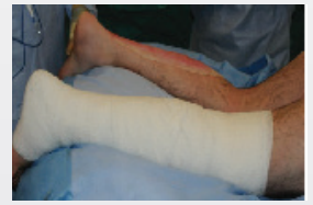
Day 2-7: ASSIST Silver reapplied as required