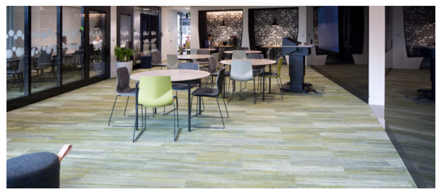
Carpet : Clerkenwell, Time Piece