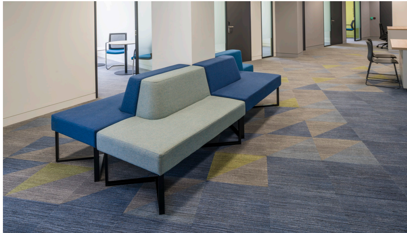
Carpet shown : Naturally Drawn - Hand Sketched with additional custom design features