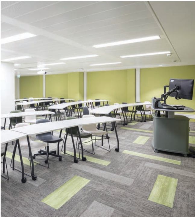
Carpet shown : Arctic Survey - Isotherm with Colour Compositions