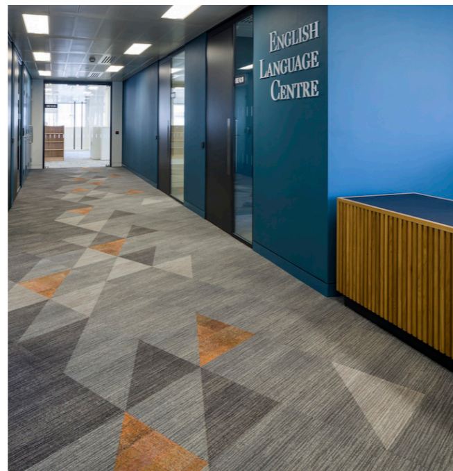
Carpet shown : Naturally Drawn - Hand Sketched with additional custom design features

This challenging project was to play an important role in affirming Kings College's position as a world leading educational institution. Having worked on the restoration of the building, John Roberston Architects (JRA) were appointed by the estates team at Kings to develop an aesthetic for the interior that would combine the best of Bush House's heritage with the diverse requirements of a modern university.