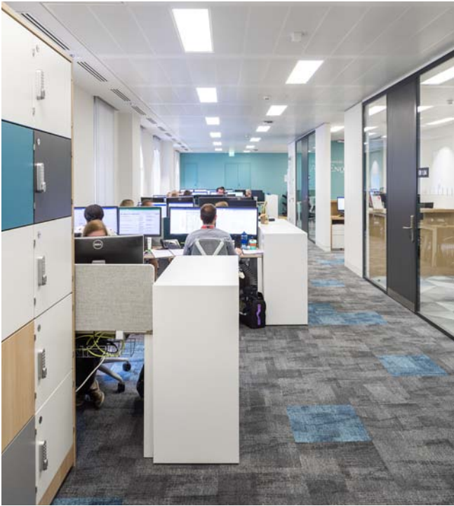
Carpet shown : Omni - Admit One