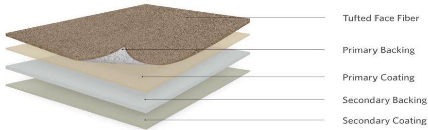
Figure 1: Illustration of Milliken Broadloom carpet construction.